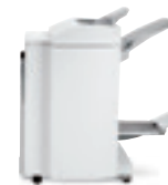
High Volume Finisher with Booklet Maker