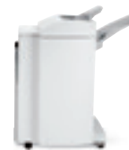
High Volume Finisher